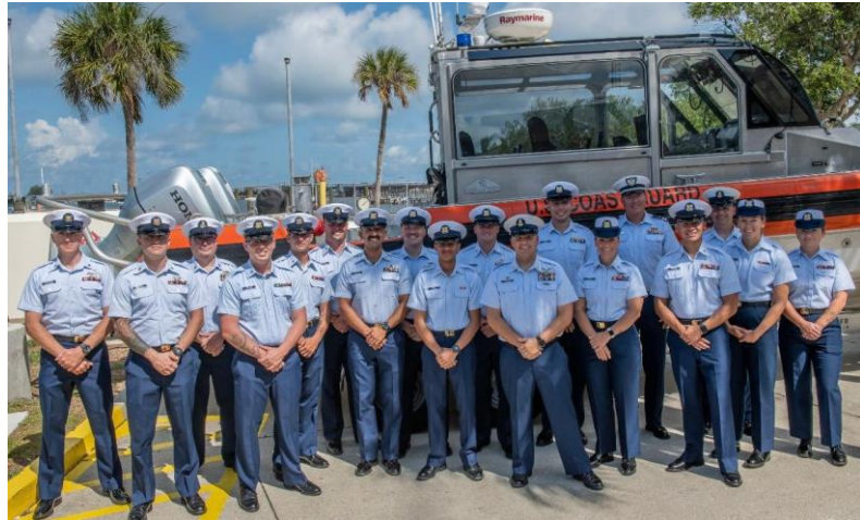
CGSTA Cortez Crew