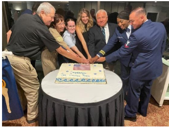
Heroes Cutting the Cake