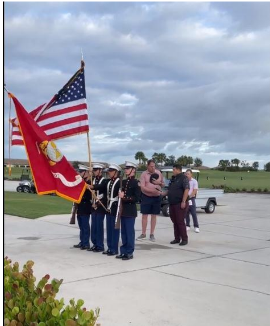
VHS MCJROTC Color Guard