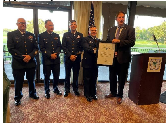
Adoption of USCGC Shrike