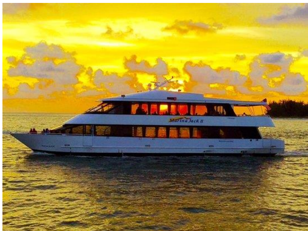
Marina Jack II

After two hours' cruising and a delicious dinner, the Marina Jack II made its way back to the pier. A wonderful evening among friends of the Navy and the Naval Academy.