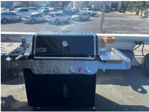
The Gas Grill