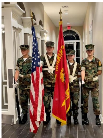
At Island Walk