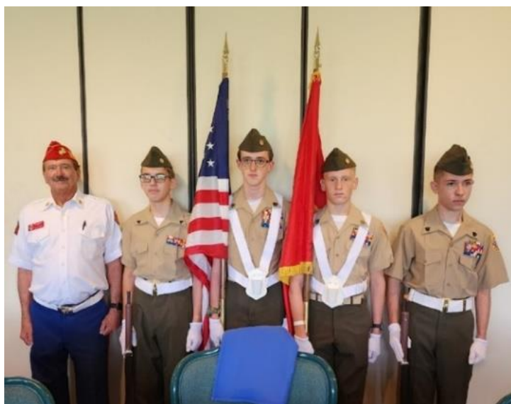
NP Imagine School YM Color Guard