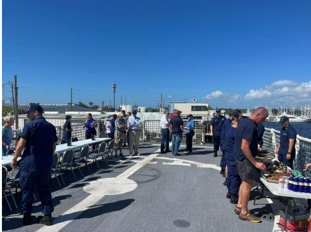
The Chow Line