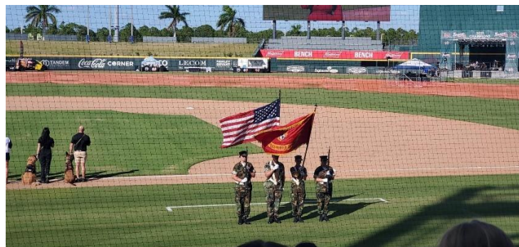
At Cool Today Park

On 11/4, VMYM presented the Colors at the Celebrity Softball Game, a charity event supporting My Warriors Place at Cool Today Park. On Tuesday 11/7 Colors were presented at Grand Living at Wellen Park's Veterans Day event. On Thursday, 11/9 VMYM presented the Colors at Garden Elementary's Veterans Day event and on Friday, 11/10 they presented at Taylor Ranch Elementary's event. On Friday afternoon VMYM presented at the Ledbetter Law Group Veterans Day event. On Saturday morning the VMYM marched in the City of Sarasota Veterans Day Parade. After the parade on Saturday, VMYM presented Colors at Country Club Estates and Island Walk. On Friday, 11/10 the VMYM Leadership classes celebrated the 248 th Marine Corp birthday in all 6 classes. The YMs watched the Commandant's birthday message, learned the protocols and history of the ceremony, and enjoyed delicious cake. VMYM is looking forward to the YM Recruit Graduation on Thursday, December 7, the wreaths laying on December 16, and our 2 nd Q event, a day of ice skating, on December 21 st .