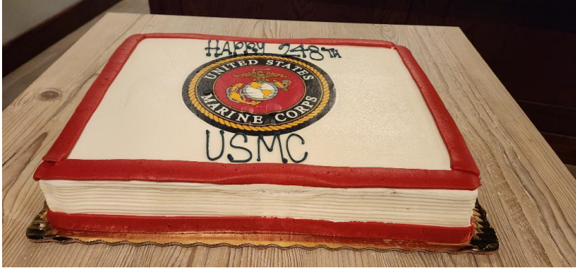
Happy Birthday Marines!