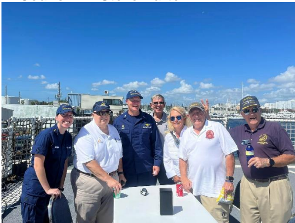
Navy Leaguers and Crew