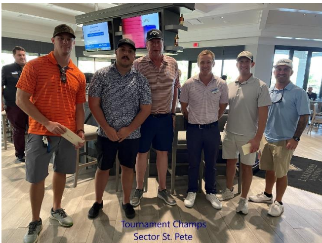
Tournament Champs Sector St. Pete