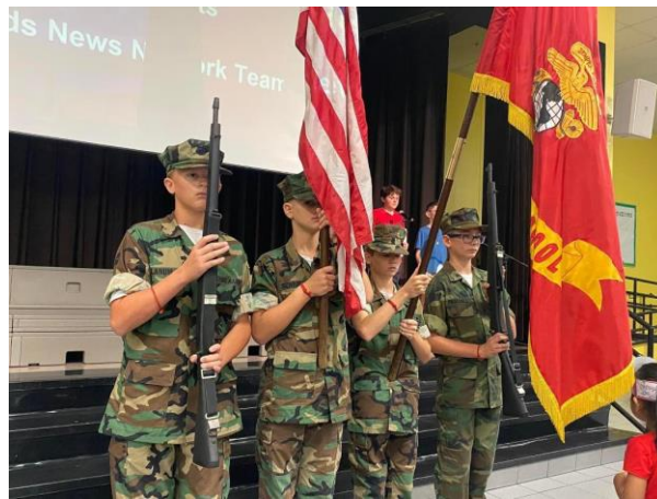
At Venice Elementary School