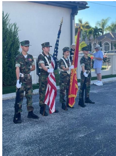
In the Sarasota Veterans Day Parade – At Venice Gardens Elementary School