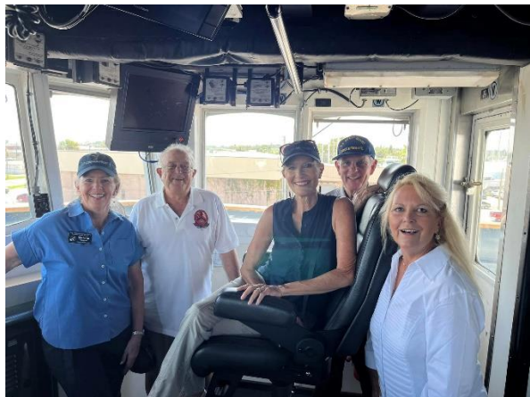
On the Bridge