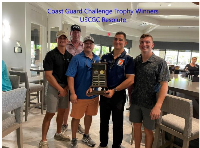
Coast Guard Challenge Trophy Winners USCGC Resolute