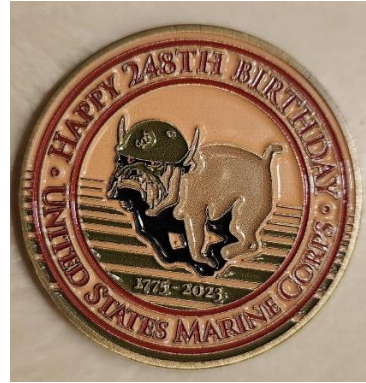
248 Birthday Coin