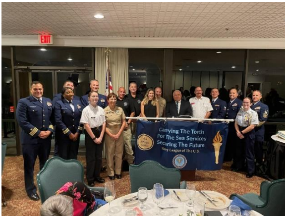
Heroes and Their Sponsors